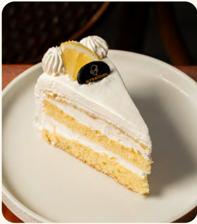
LEMON CAKE 75k A soft and moist cake with a refreshing lemon flavor