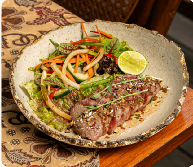
THAI BEEF SALAD Thailand beef salad with onion, peanut & nam jin dressing