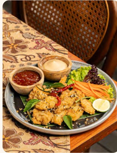
FISH POM POM Deep fried pop breaded fish, mix forage herb, lettuce, spiralled carrot, sweet chili sauce & hoisin mayo