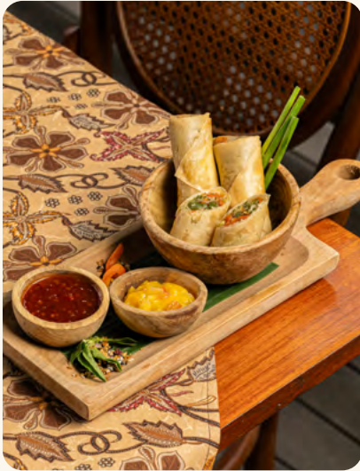
CHICKEN SPRING ROLL Chicken cube, vegetable, vermicelli, sweet chili sauce & mango chutney