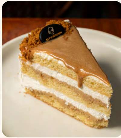
BISCOFF CAKE 75k Moist cake layered with Biscoff's warm cinnamon and caramel flavors, finished with a rich Biscoff frosting