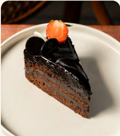
CHOCO BERRY CAKE 75K Decadent chocolate dessert with sweet berry compote.