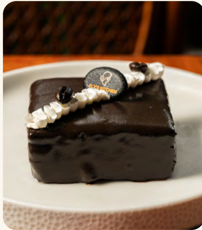
ESPRESSO BROWNIES 69k Fudgy espresso brownies with the perfect blend of coffee and chocolate