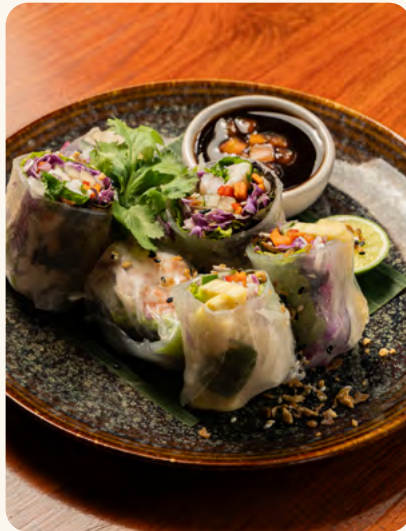
VIETNAMESE RICE PAPER ROLL Vietnamese rice paper, prawns, lettuce, avocado, coriander mint & sweet chili dipping