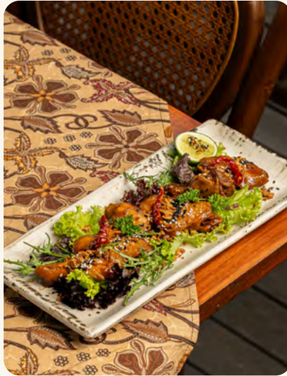
GLAZED CHICKEN WINGS Deep fried chicken wings with homemade BBQ sauce, lettuce, crushed nut & lime