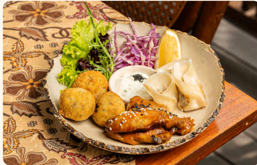
ELY'S SAMPLER A popular Dutch snack, Bitterballen are balls made from meat, mushrooms, and melted cheese inside, which are fried deliciously with crispy breadcrumbs, glazed chicken wings, swiekiau & coleslaw salad