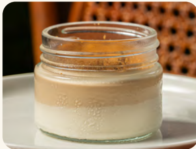
PANNA COTTA LOTUS 65k Silky panna cotta paired with the rich flavor of Lotus