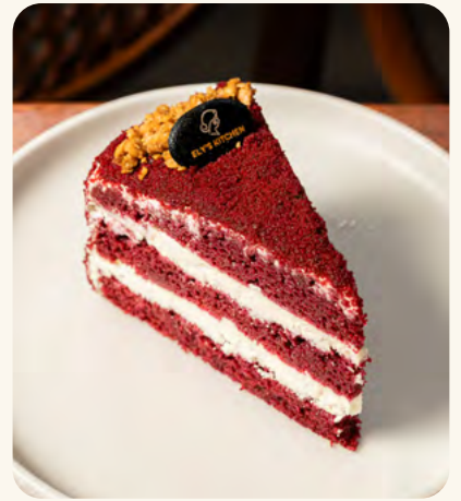
RED VELVET 75k A soft, moist red velvet cake with rich cream cheese frosting