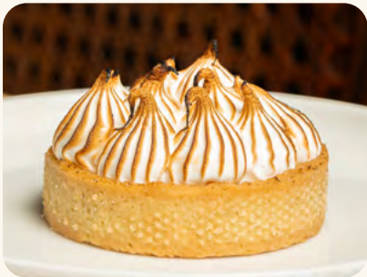
LEMON TART 69k Delightful and zesty dessert that beautiful showcase the bright and tangy flavours of fresh lemons