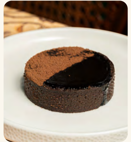
CHOCO TART 69k A rich, indulgent pastry for chocolate lovers