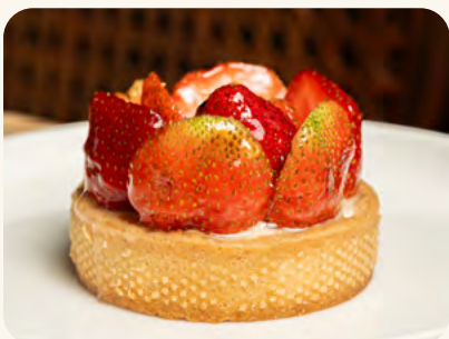
MIX BERRY TART 69k A buttery pastry filled with sweet and tart mixed berries