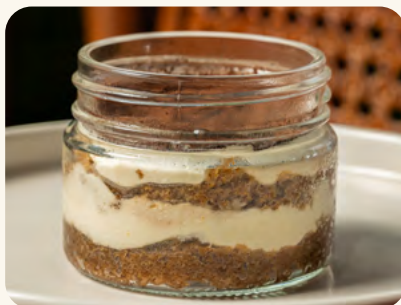
TIRAMISU 69k In jar is a delightful and visually appealing twist on the classic Italian dessert, it presents all the beloved flavours and textures of traditional tiramisu in a convenient and charming individual serving.